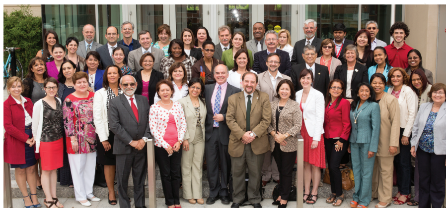
IX Pan American Conference